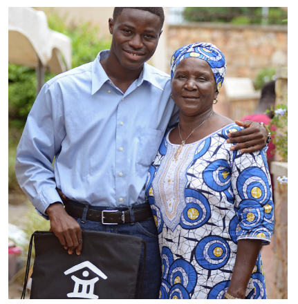
1,339 students enrolled

Ashesi's undergraduate Class of 2025 represented 20% of applicants to Ashesi this year, with 345 being enrolled.