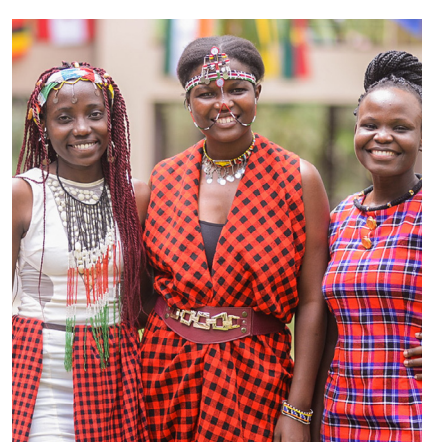
28 countries represented

Increasing female enrolment is a priority for our team. More than half of the students receiving scholarships are women.