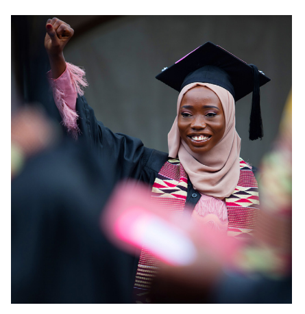
43% of students are on scholarships

The university has built a strong reputation around empowering African women as university graduates and strives to maintain gender balance in the student body.