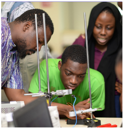
9th place ranking in Africa

Ashesi's undergraduate Class of 2025 represented 20% of applicants to Ashesi this year, with 345 being enrolled.